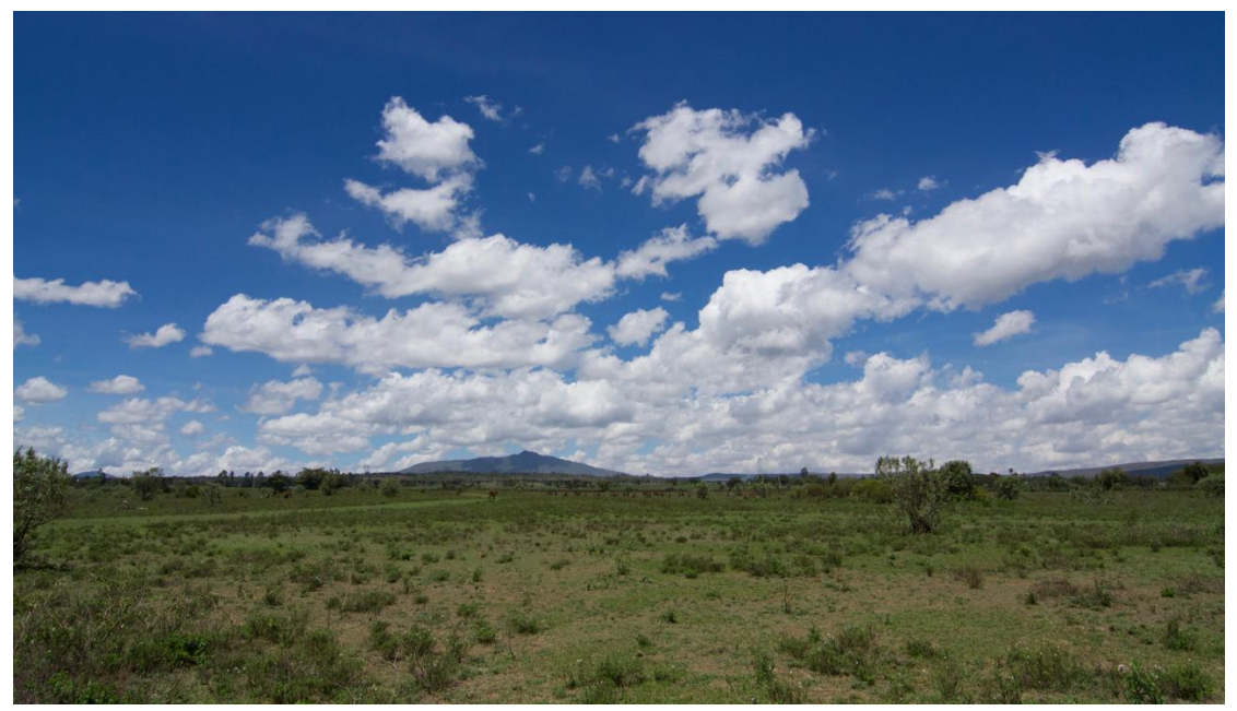
View of the sanctuary from the accommodation

Volunteers will stay in a dedicated complex on the sanctuary, designed and built to be completely carbon-neutral and off-grid, ensuring freedom from regular Kenyan power cuts! Electricity is provided by solar power, as is hot water. Water is sourced from an on-site borehole. The accommodations are made from fabricated shipping containers, offering extra safety. Meals will be prepared by a chef in a communal kitchen and there is a spacious semi-outdoor courtyard with aBBQ and open firepit. Volunteers will also benefit from a weekly laundry service and a twice-weekly cleaning service.