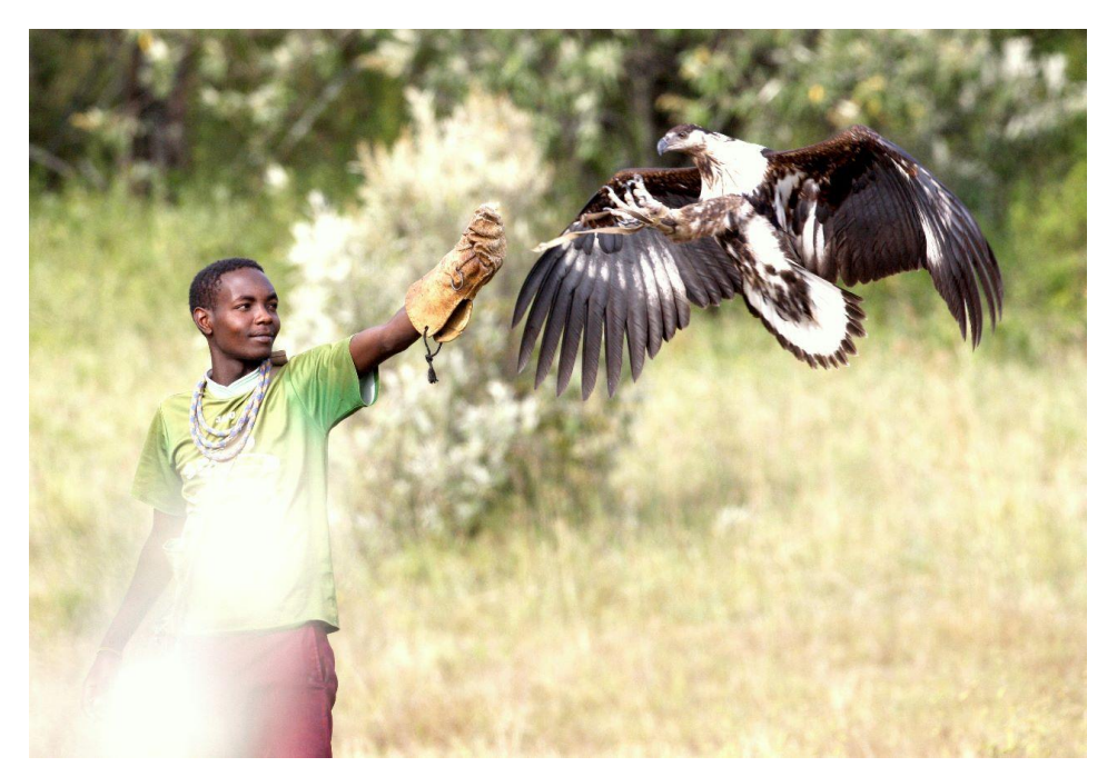
Raptor technician at Soysambu Raptor Centre training a rehab juvenile Fish Eagle

Participating in research projects involves hands-on fieldwork, including activities such as trapping and banding raptors, conducting road transects, and studying population dynamics and breeding patterns. Volunteers will also have the opportunity to engage in projects focused on other wildlife within the Soysambu Conservancy. When not in the field, volunteers will assist with data input and processing, as well as photo identification of birds and animals recorded in the field. A significant part of the day will be spent on observing the hunting flights of birds gearing up for release by the resident falconer.