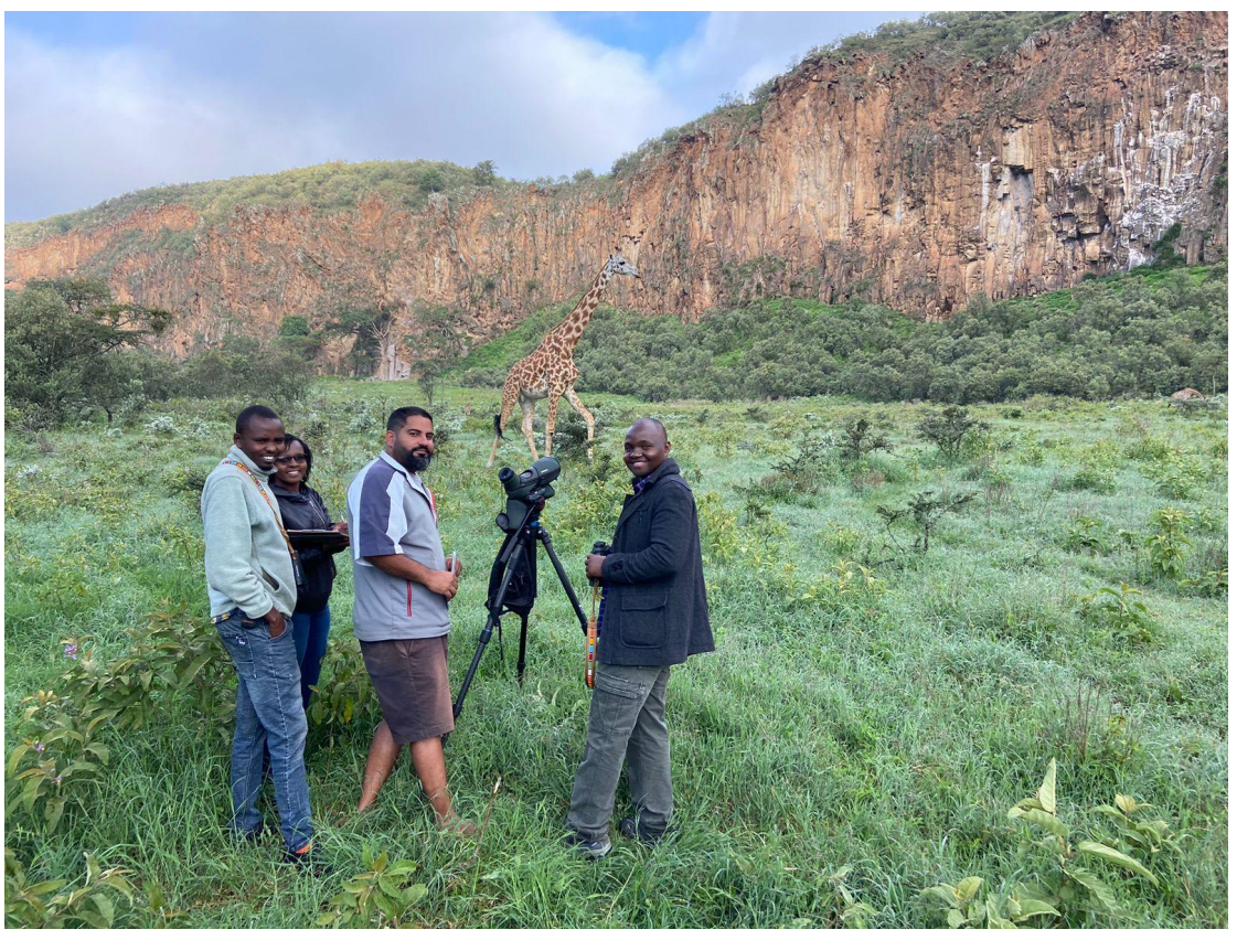
Monitoring Rüppell's Vultures at Hell's Gate National Park