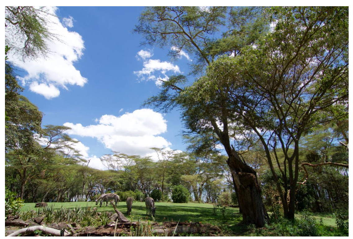
View of the sanctuary towards the lake

The Naivasha Raptor Centre (NRC), located within the Kilimandege Sanctuary on the shores of Lake Naivasha, serves as the main operations base, where injured birds brought in for treatment and rehabilitation, taking their first steps toward recovery and eventual release. NRC is open to visitors (private and school groups), offering an opportunity to learn about raptor conservation firsthand. It is also where all of our volunteers are initially housed and undergo training.