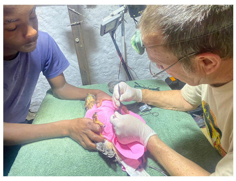
Renowned raptor expert Simon Thomsett treating an injured Black Sparrowhawk.

All volunteers and interns will also have the opportunity to travel locally to places such as Nakuru National Park, Lakes Bogoria and Baringo. In addition, they can enjoy their leisure time in and around Naivasha, exploring local lodges and restaurants.